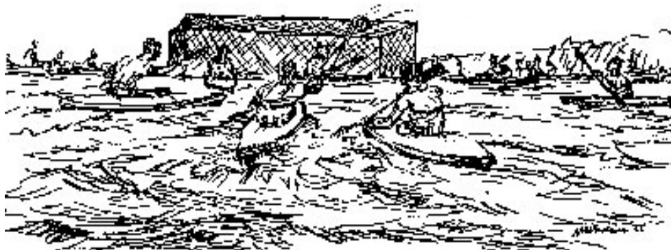
Kanupolo – Germany circa 1935. Geschichte des kanupolo, Deutsche Meisterschaften, vom 2, 5 Sep 2004

An international competition beckoned. An enthusiastic following had grown through the schools in England