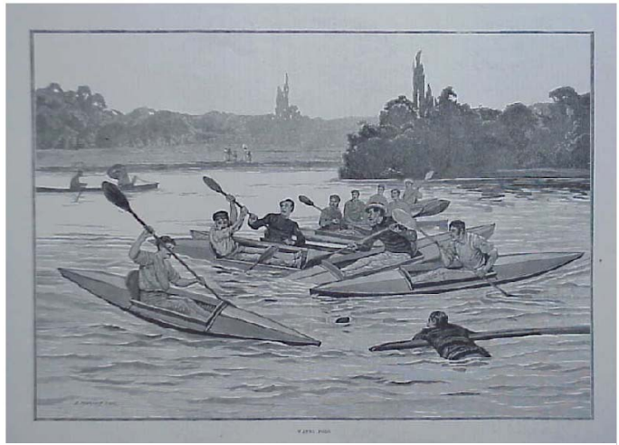
Water Polo. The Graphic, 1884.

The Canoe Club of France introduced canoe ball games to canoeing festival programs in 1929. The games soon developed to become a sport with a playing area of 60–100 m long by the width of the river. Goals sat on the water and teams comprised 3, 4, or 5 boats. In 1935 a group of paddlers set guidelines for a game called ‘canoe ball’ to be played at the festivals—its primary aim was to vary training and to test paddling skills. It was not intended to create a competitive sport although by 1943 the playing rules were formalised, the large playing fields were reduced to 80 m x 35 m, kayaks replaced canoes, and canoe ball became ‘kayak ball’.