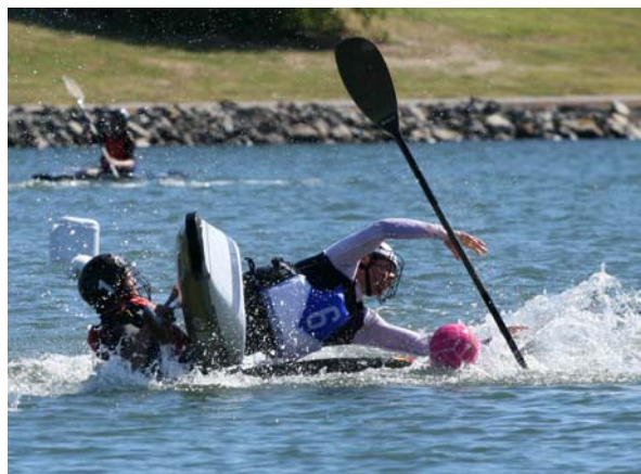
The modern game is fast and exciting as this (illegal) tackle shows.

The author wishes to acknowledge the various sources that have provided the material for this history. Along with the references given below, many players have shared their recollections of the game's changes over