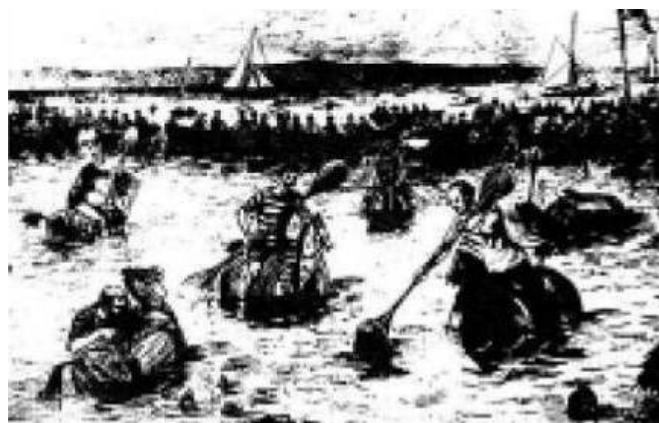
Water polo at Hunter's Quay, Scotland , The Graphic , 1880.